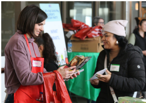
Volunteering at Children's Holiday Party