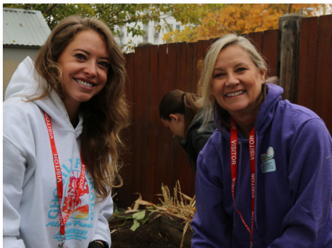
Volunteering at Girls Inc of Metro Denver