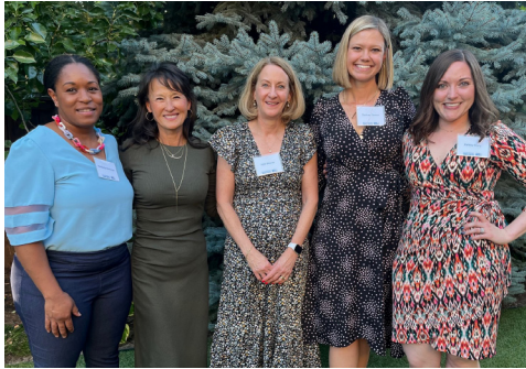
Women United Kickoff Fall 2023